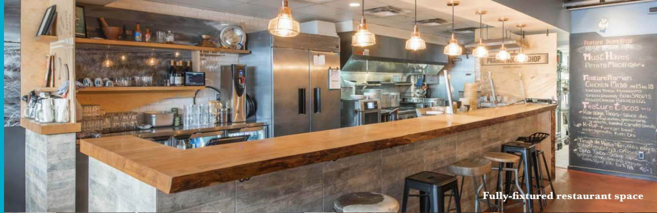
Fully-fitted restaurant space