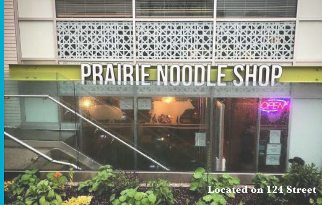
Located on 124 Street