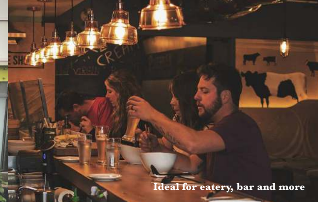
Ideal for eatery, bar and more